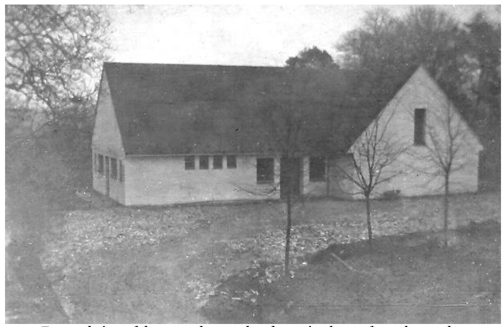
Figure 1: External view of the recently completed meeting house from the north-east, 1936

In 1935 the present site was bought for £650. A meeting house was built to designs by the architect Leonard Brown, who was a member of Letchworth Meeting. It opened on 5 April 1936, having cost £1,900. Apart from a meeting room it contained three classrooms, toilets and a small kitchen. One of the classrooms was later converted to a larger kitchen. In 1950, Leonard Brown was in charge of small-scale repairs. In c.1953 additional land was bought. In the 1960s, a bicycle shed was built, faulty roof tiles were replaced, and metal railings and gates installed. In 1997–8, the entrance door was moved and a small extension added to provide toilet facilities (architect: David Neill). Planning permission was also granted for the provision of a warden's flat on the first floor but this remained unrealised. Instead the attic was converted into an additional meeting room with new dormer windows and skylights. In 2013, 17 photo-voltaic panels were installed on a south-facing roof slope.