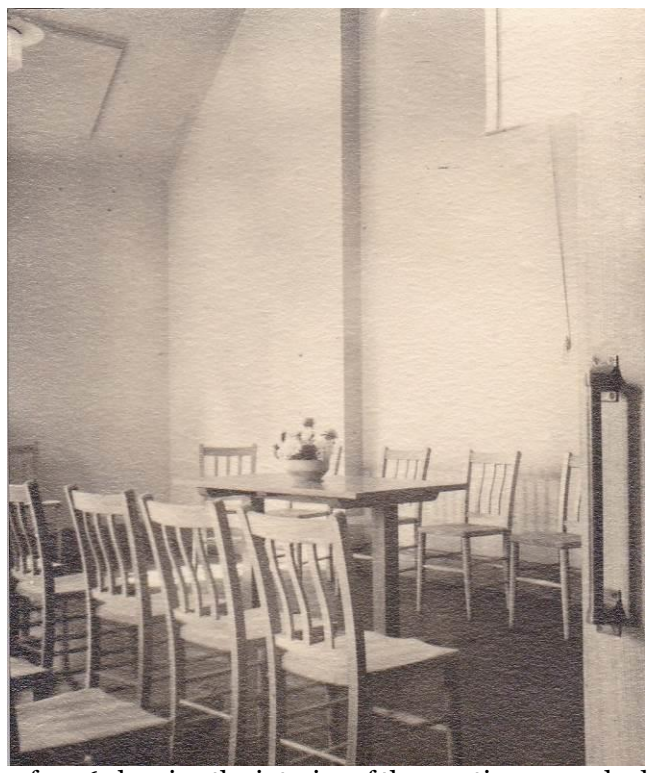
Figure 2: Photo of 1936 showing the interior of the meeting room, looking north-west